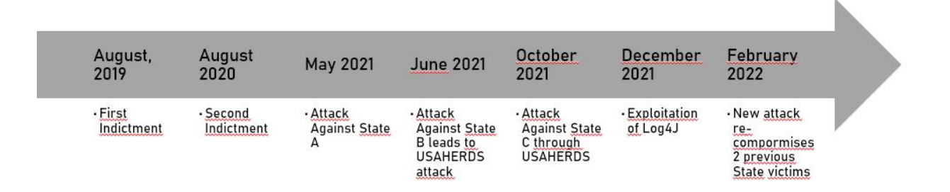
Figure 3.5: Timeline of the USAHERDS case.

laysia, Pakistan, Singapore, South Korea, Taiwan, and Thailand. the interesting aspect that may raise questions on its own is that the targeted countries and companies do not include Countries known to be more lenient in the battle against these hacking groups, such as Russia and Continental China, even though they do have large companies both in the supply chain and in the telecommunications sector.